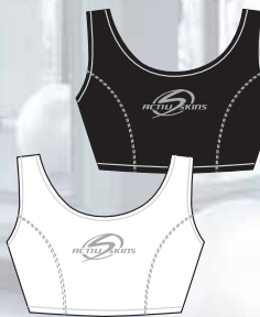
Ladies' crop top