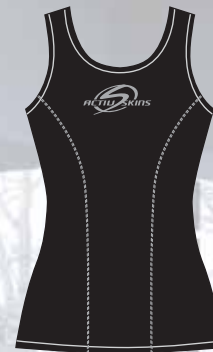
Ladies' tank top with shelf bra