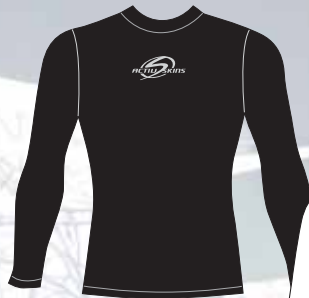
Men's long-sleeve crew neck top