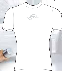
Men's Short-sleeve crew neck top