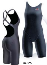
R825 ladies' above the knee suit