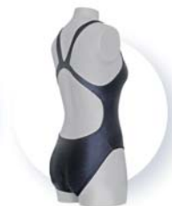
R450 ladies' skinnyback costume

To order or if you are interested in becoming a Speedskins agent, please call +27 21 762 2322